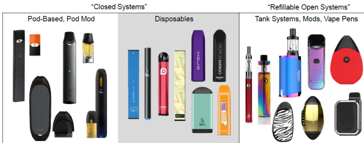
Sample of e-cigarette products. Images are not to scale.

The term “electronic cigarettes” covers a wide variety of products now on the market, from those that look like cigarettes, pens or USB drives to somewhat larger products like “personal vaporizers” and “tank systems.”* Instead of burning tobacco, e-cigarettes most often use a battery-powered coil to turn a liquid solution into an aerosol that is inhaled by the user. There are a wide range of reusable e-cigarettes and “pods,” which enable users to replace a nicotine-containing cartridge or refill a tank with a liquid solution, and there are disposable e-cigarettes, which cannot be refilled. There are also “mods,” which are units that users assemble themselves from separate component parts, to allow variation in battery power, style, and size. 4 A study found more than 430 brands of e-cigarettes available for purchase online in 2017. 5 As of November 29, 2020, pre-filled cartridges for pods made up 66.1% of sales in traditional retail outlets, † while disposable e-cigarettes made up 33.9%, more than doubling their market share since January 2020. 6